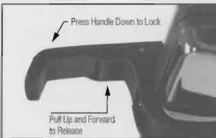
Figure 2. Locking latch.